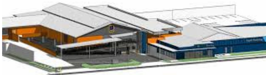
Vision of renovations at Aldi with all new Caloundra Chempro Chemist